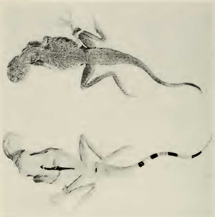
FIGURE 2. Dorsal (above) and ventral (below) view of lectotype of Phrynocephalus ornatus Boulenger.

three scales separate nasals from upper labials; two or three suborbital scales, none larger than adjacent scales; no dark-margined light dorsolateral stripe between fore and hind limbs.